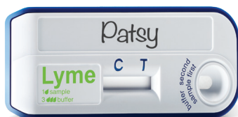
Lyme Rapid Test