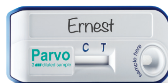
Parvo Rapid Test