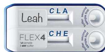
Flex4 Rapid Test