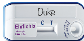
Ehrlichia Rapid Test