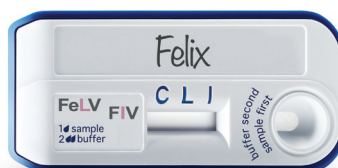
FeLV/FIV Rapid Test