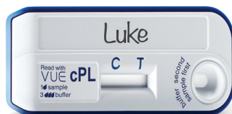
cPL Rapid Test*