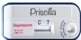
Heartworm Rapid Test

The VETSCAN® Rapid Test portfolio gives you more of what you want and less of what you don't need. Now you have more options, more confidence, less hassle and less waiting. VETSCAN Rapid Tests deliver the perfect balance of price and performance.