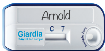
Giardia Rapid Test